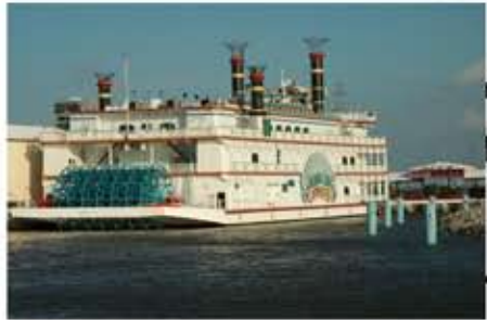
Treasure Chest Casino

(9) Williams Boat Launch and Treasure Chest Casino N30 02' 37" W90 14' 09"